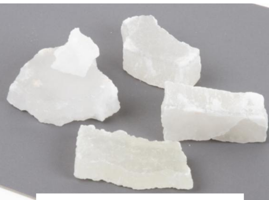
Cleaning-Tinning blocks !

All procedure is very simple and will take couple of seconds. Once you try it yourself than you will appreciate and make it your routine to use Cleaning-Tinning block!